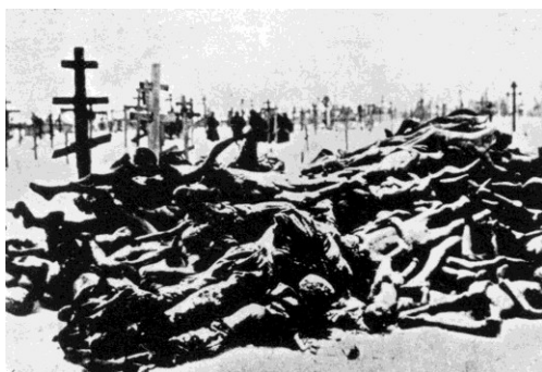
Ukrainian Genocide by the Bolsheviks

It can be seen in the ethnic genocide against the Ukrainians. The Jewish Bolsheviks purposefully murdered them to reduce their numbers, and then flooded their country with non-Ukrainians to destroy their national/ethnic unity (See: Holodomor chapter ). Raphael Lemkin, father of the word genocide , wrote this in his article "Soviet Genocide in Ukraine."